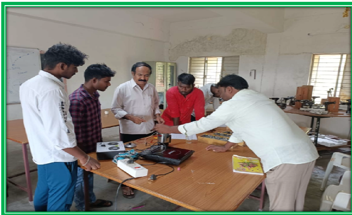
Teaching in Experimental Method